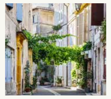
THE GLOBE AND MAIL JOURNALIST ON TOUR**