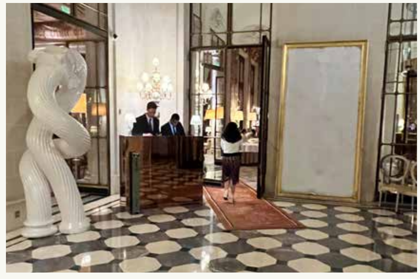
THE GLOBE AND MAIL JOURNALISTS ON TOUR**