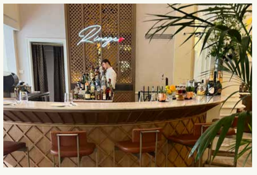
THE GLOBE AND MAIL JOURNALISTS ON TOUR**