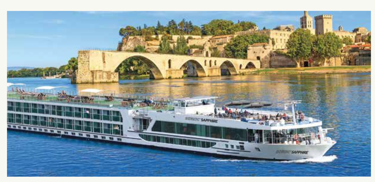
THE GLOBE AND MAIL JOURNALISTS ON TOUR**