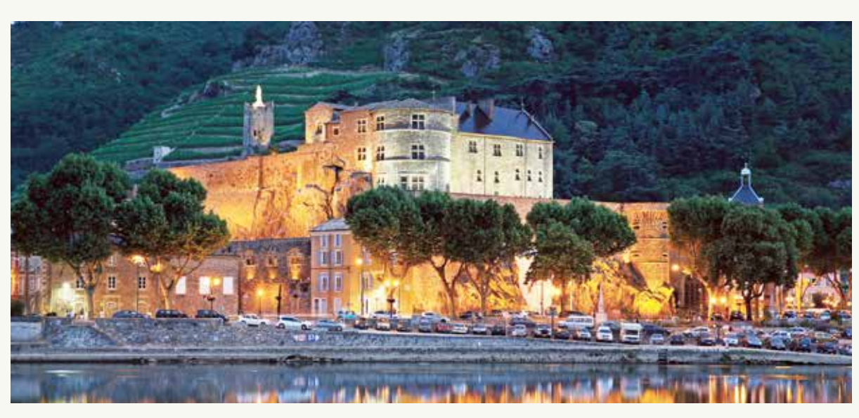
THE GLOBE AND MAIL JOURNALISTS ON TOUR**